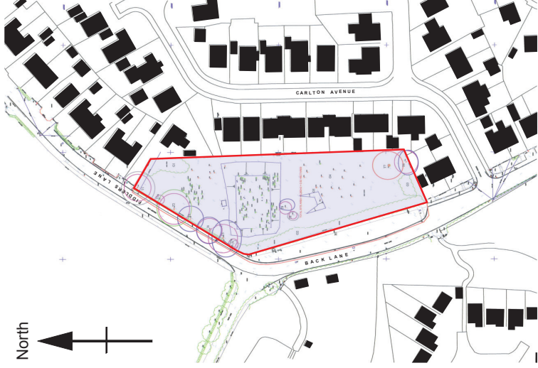
Existing Location Plan 1:1250