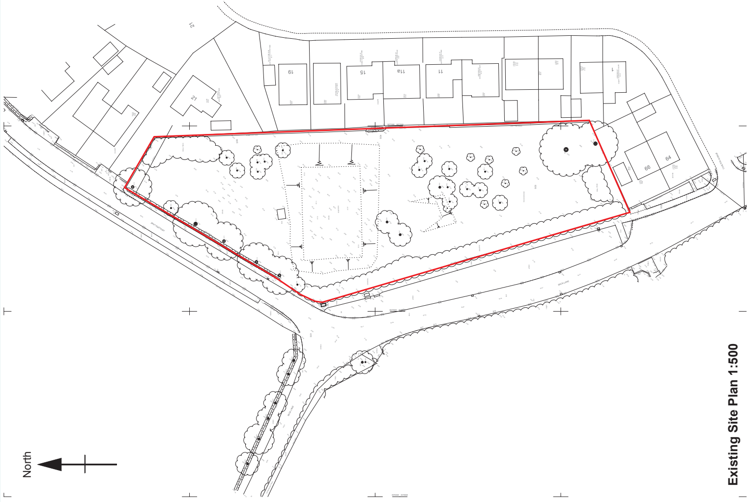
Existing Site Plan 1:500